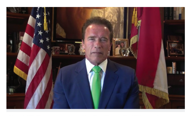
Arnold Schwarzenegger for the Summit of Conscience (July 21, 2015 - Paris)

Arnold Schwarzenegger, R20 Founder, who was unable to participate in person, sent in an inspiring video .